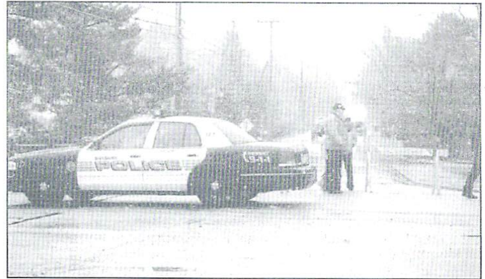
Duxbury Police divert traffic from Powder Point and St. George Street because of the flooding on Washington Street .